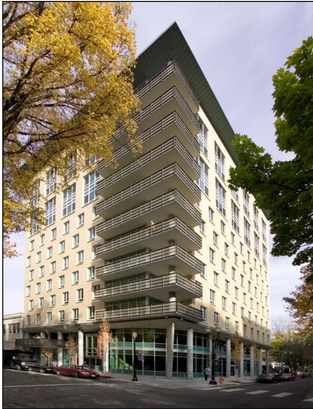
New Construction 2004 – Harris Building