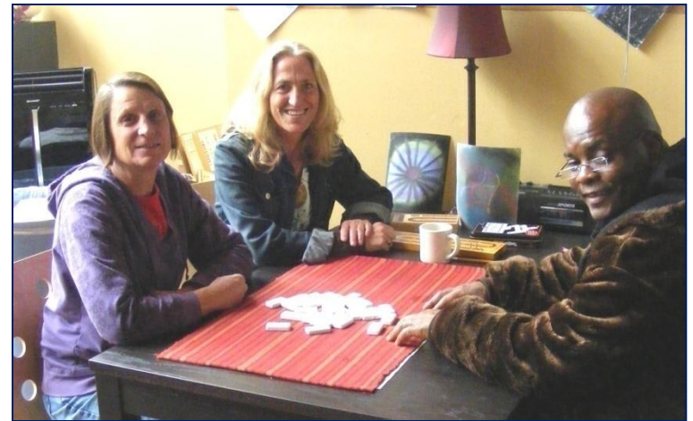
CEP Community Room